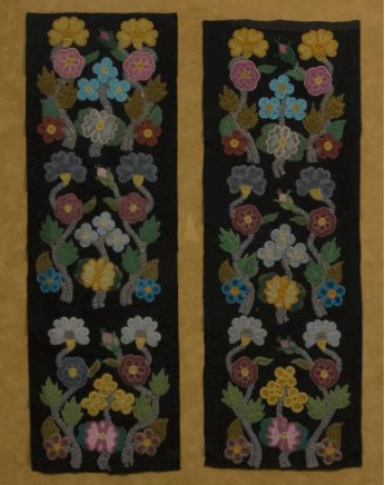
Photograph of beaded legging panels - 2 panels. This item is part of the Gabriel Dumont Institute Museum Collection.

The GDI Board of Governors is responsible for the development of Institute policies and programs, for the development and approval of programs, and for the general administration of the Institute.